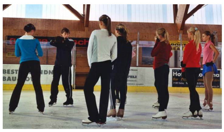
A minimum number of participants is required